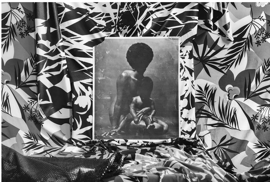
Keisha Scarville. Within/Between/Corpus (1) , 2020. Photography.

Among the many topics discussed are the role of collaboration in photography and archival practices, the relevance of the Caribbean in photography history, and current photographic debates around materiality, ecology, and climate change.